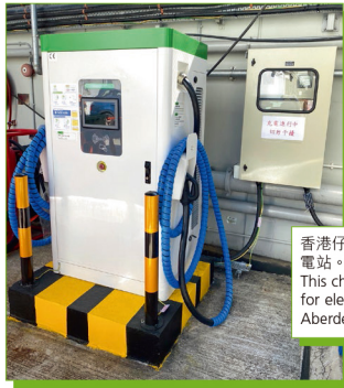
香港仔警署內的電動車充電站。 This charging point caters for electric vehicles at the Aberdeen Police Station.

Measures are in place to lower greenhouse gas emissions from the Marine Police's fleet. Examples include the use of biodegradable B5 diesel and an emission management system for engines in new vessels.