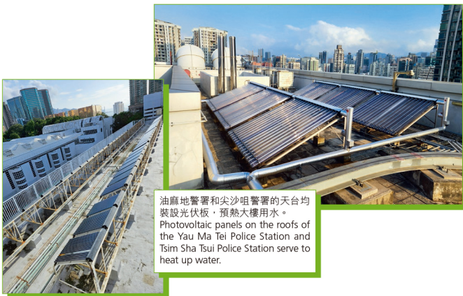
油麻地警署和尖沙咀警署的天台均裝設光伏板，預熱大樓用水。 Photovoltaic panels on the roofs of the Yau Ma Tei Police Station and Tsim Sha Tsui Police Station serve to heat up water.

Solar hot-water heating systems are also in use in the Kowloon East Regional Headquarters Complex, Tsim Sha Tsui Police Station and Yau Ma Tei Police Station.