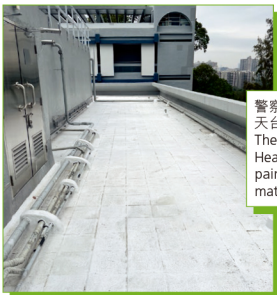
警察機動部隊總部大樓天台採用隔熱漆。 The Police Tactical Unit Headquarters has been painted with anti-heat material on its roof.

The Force continues to explore the incorporation of more green features to reduce energy consumption. For example, a number of police stations converted their lighting systems to light-emitting diodes (LEDs) and replaced aged chillers to raise energy efficiency. In addition, anti-heat paint was applied on the roof of the Police Tactical Unit Headquarters building to lower its surface temperature.